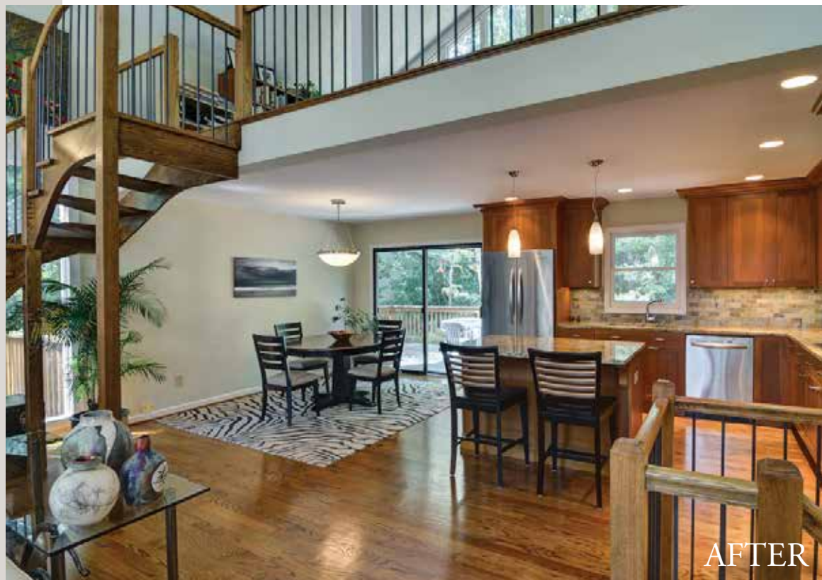
The neutral walls and straight lines create an uncomplicated atmosphere while the rich wood tones and curved staircase provide interest and character. The blending of modern lighting with the Mission-style cabinets further enhances the transitional style of this space.