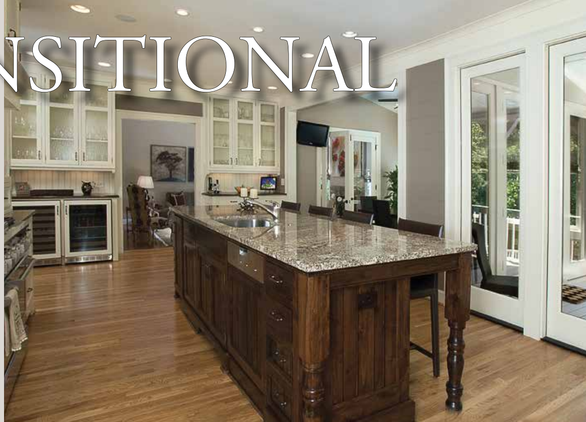
White shaker style cabinets with clean lines surround a dark stained bead board island. Warm hardwoods act as a traditional anchor to the stainless steel appliances and brushed nickel fixtures which add modern themes, culminating in a kitchen that exemplifies transitional style.